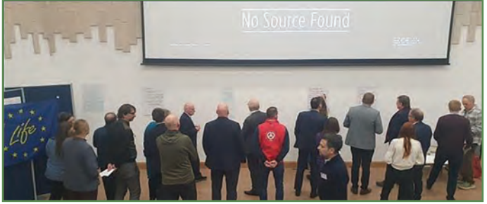
Figure 8. Working towards establishing an Irish GBR Sector workshop

engaging policy makers, farmers, farming representatives and the AD sector and providing them with tailored evidence of the potential benefits of GBR with the objective of advocating for supportive policy changes to establish and drive an Irish Green Biorefinery Sector.