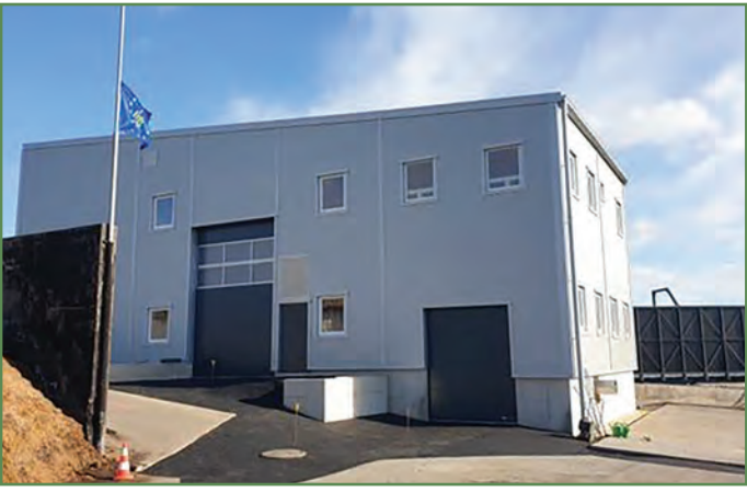
Figure 3a. The Green Biorefinery plant in Japons Austria

The 1st step within LIFE farm4more's Green biorefinery pilot plant (www.farm4more.ie/biorefinery/) which has been built by partners BRID, BioNorum and TBWR in an organic Region in Japons, Austria (Figure 3a, 3b), is fractionating inputted grass-clover silage feedstocks (Figure 4.a) into a; press cake (Figure 4.b) which can be fed to cattle immediately or preserved for future use by applying a re-ensiling process; and a press juice (figure 4.c) which is further refined by a novel downstream process into a high value organic protein and amino acid concentrate, as feeds for pigs and chickens.