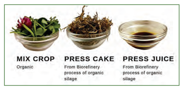
Figure 4 a. Organic or sustainably produced grass-clover silage as a green biorefinery input feedstock b. green biorefinery press cake and c. green biorefinery protein juice processed into high value organic protein products and amino concentrate feeds for pigs and chickens.